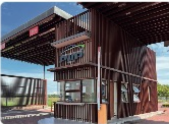
HEALTH, SAFETY, SECURITY & ENVIRONMENT