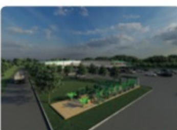
PULAU INDAH CENTRE OF EXCELLENCE